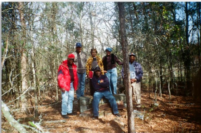
March 24, 2008