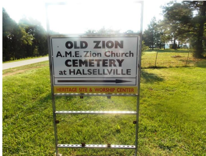
Highway Location Sign Erected