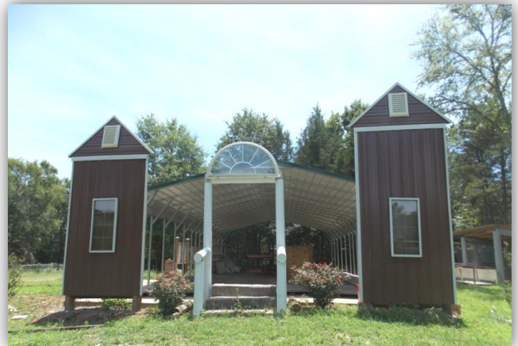
June 10, 2016